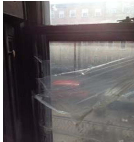
Opportunity for Air Sealing

The Starter Package with or without the conditional measures also includes a number of health and safety (H&S) and operations and maintenance (O&M) best practices. The allowable H&S/O&M costs increase when the conditional measures are added, reflecting NYSERDA's programmatic guidelines to restrict these costs to 15% of the total package cost. Prior to any work, it is required that homeowners' boilers and hot water heaters are tested for acceptable CO levels. If they exceed acceptable levels, homeowners need to have them tuned to ensure proper combustion and safety.