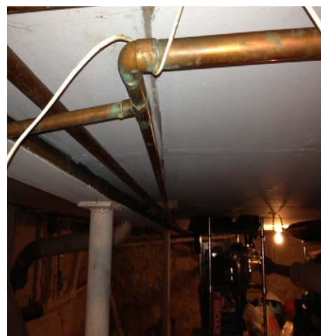
Basement Pipes Without Insulation