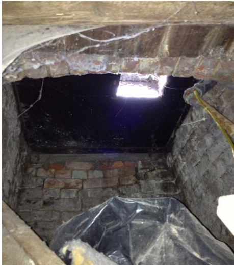
Unsealed Basement Coal Chute

Despite the clear overlap in applicable, cost-effective measures during the test phase, we determined to restrict eligibility for the remaining audits to gas heated homes with radiators because of the unique nature of evaluating and improving forced air equipment and distribution ductwork. We also determined to further narrow the criteria for participation to homes that did not have central air conditioning and that had flat roofs—two elements that were likely to skew energy use and the cost of improving the attic cavity. These additional elements helped to ensure that the buildings had similar enough systems and characteristics.