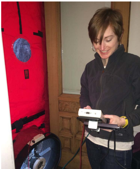
Conducting a Blower Door Test

To address this, we sought to capitalize on the redundancy in the building stock by developing a standard package of energy retrofit measures based on building typology. We hypothesize that this package can be applied to tens of thousands of small homes while mitigating the pervasive barriers to retrofit implementation, and that the overall standardization approach can simplify, expedite, and accelerate small home retrofits throughout the city. As part of the study we audited 24 similar buildings—two family, masonry, attached, gas heated homes—to develop a simple, cost-effective package of energy efficiency measures. The study identified a clear set of measures applicable to every building in the study's sample set. This starter retrofit package has an estimated average cost of only $3,312 with expected annual utility savings of 14% and a Savings to Investment Ratio (SIR) of 1.74. We also found that if additional conditional measures could be added to the package, it would raise energy savings in many homes to 21%.