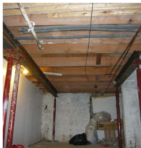
Uninsulated Basement Ceiling