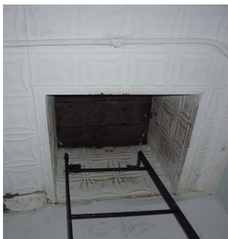
Roof Hatch Without Insulation

Similarly, if a home has no roof insulation, or if existing insulation is severely compromised, we recommend also installing roof cavity insulation (see Table 3). Once the roof cavity is entered for insulation purposes, there are additional opportunities for air sealing. As such, in these instances we assume that building infiltration will be reduced by 30%. Here too, costs and savings both increase.