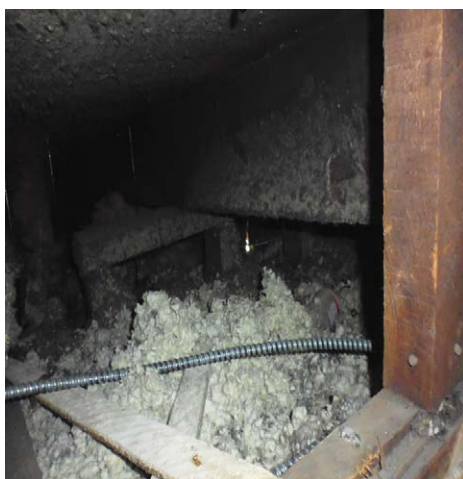
Roof Cavity With Poor Insulation

In the instances where a building does not have any or functioning roof and basement insulation, we recommend installing both types of insulation (see Table 4). The higher air sealing costs and savings stemming from entering the roof cavity are included in these instances. If the Starter Package plus both types of insulation are installed, savings increase to 21%.